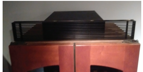
Intake hood with grill