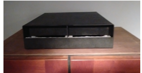
Intake hood without grill