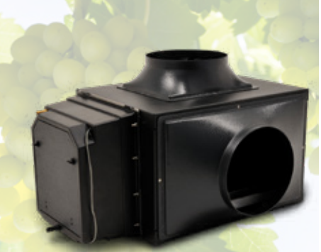
Ducted split system with integrated humidifier