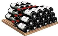
« Storage » 77 Bottles

Material: Solid Beechwood coated with an ecological water varnish.